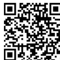
EXHIBITOR PORTAL Click or scan here

Deliveries during set-up and event days can be made to the Site Office when the Exhibitor has completed the necessary Pre-Event Information Form located in the Exhibitor Portal. Completing this form authorises Australian Events to sign for and accept delivery of goods. The Exhibitor is responsible for collecting the goods from the Site Office. No deliveries accepted at the event venue prior to Wednesday, 15 th May 2024.