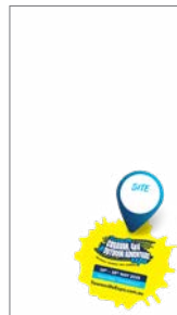
Social Media Story Template