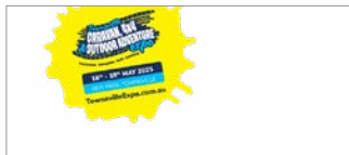
Facebook Cover Template 2