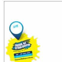
Social Media Post Template 2