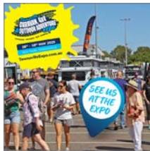
Social Media Post 2