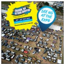
Social Media Post 1