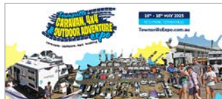
Facebook Cover 1