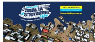
Facebook Cover 2