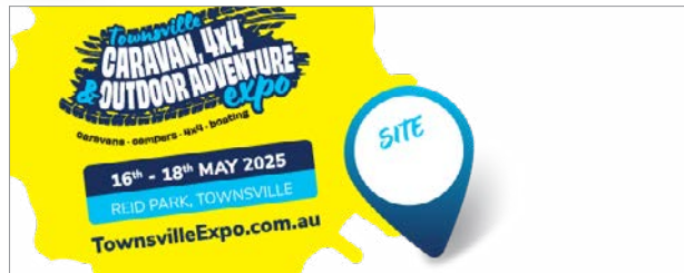
Email Signature Template 1