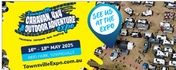
Email Signature 1