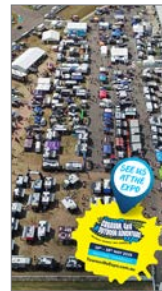
Social Media Story