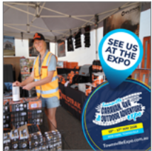
Social Media Post 1