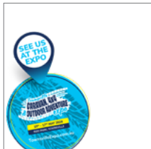
Social Media Post Template 2