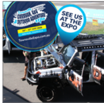
Social Media Post 2