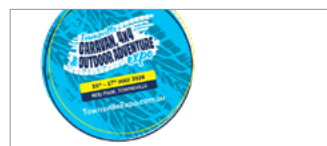
Facebook Cover Template 2