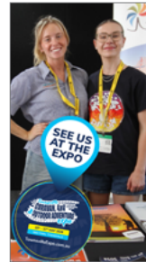
Social Media Story