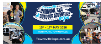
Facebook Cover 2