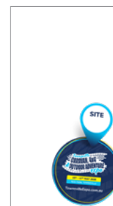
Social Media Story Template