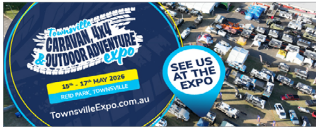
Email Signature 1