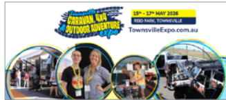
Facebook Cover 1